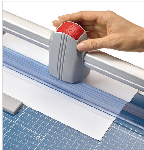
Automatic clamp applies gentle pressure to prevent your work from shifting.