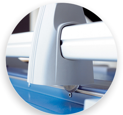
Self-sharpening system maintains a perfectly honed blade.